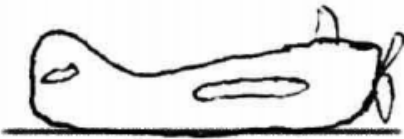
An airplane on the ground