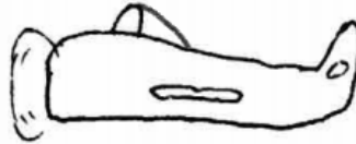
An airplane in the air